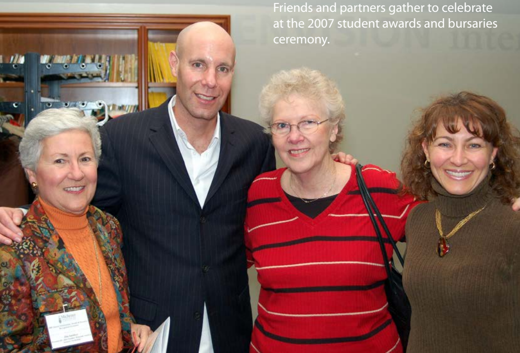
Friends and partners gather to celebrate at the 2007 student awards and bursaries ceremony.