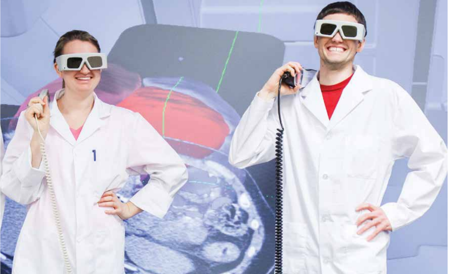
Photo: Michener is the first education institution in North America to use a Virtual Radiotherapy Training System (VERT™) to simulate 3D practice set-ups of radiation treatment techniques.