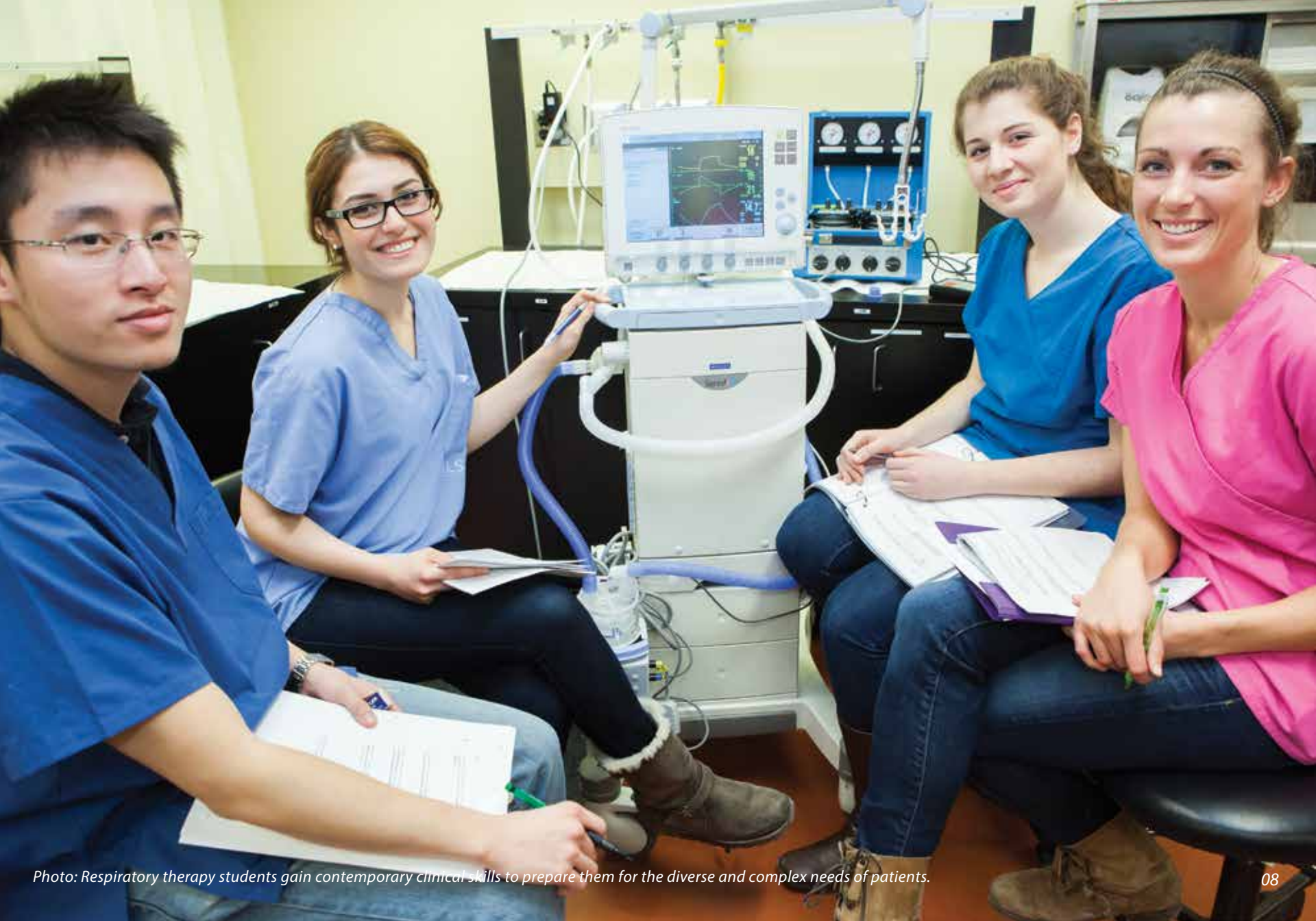
Photo: Respiratory therapy students gain contemporary clinical skills to prepare them for the diverse and complex needs of patients.