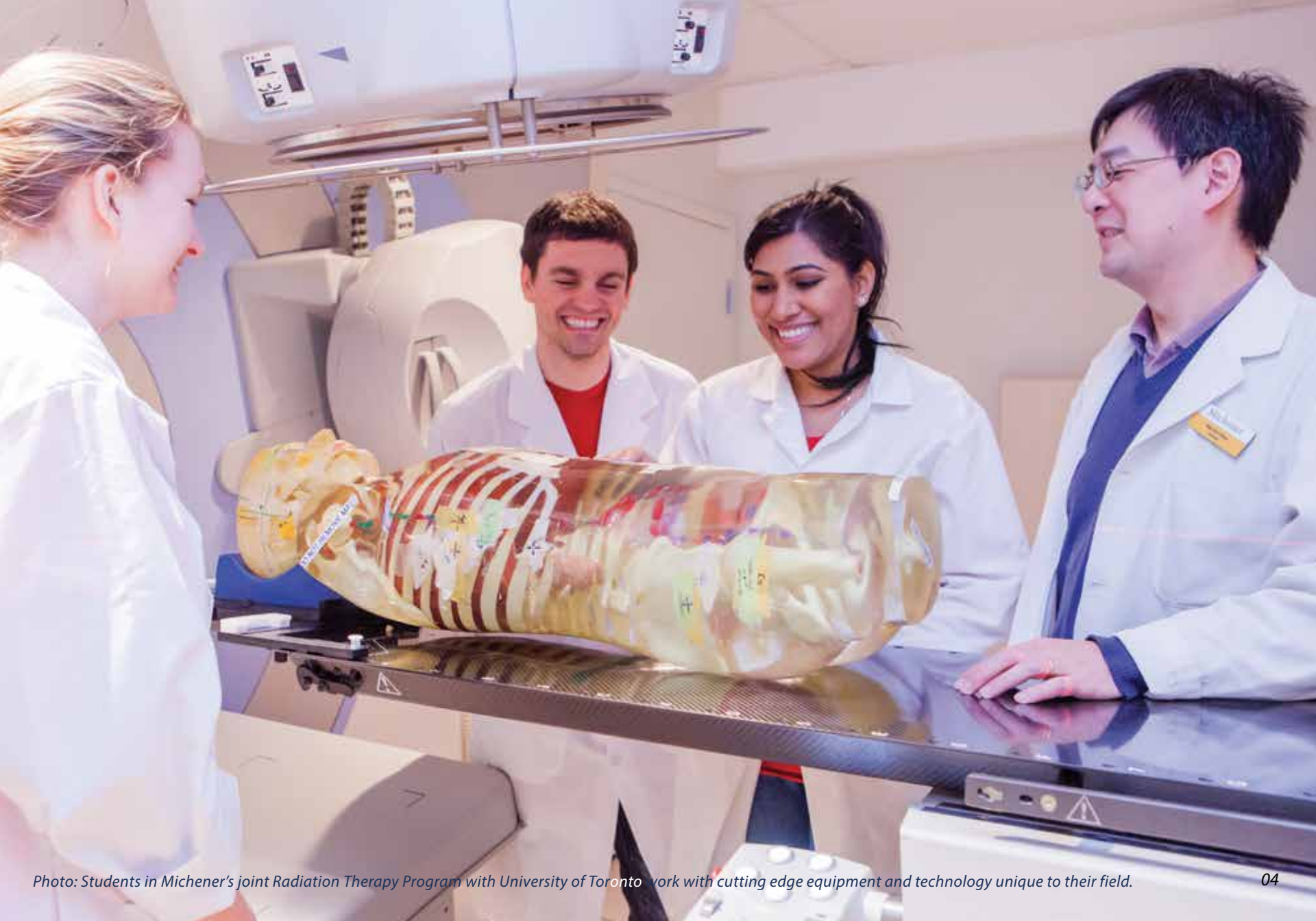
Photo: Students in Michener's joint Radiation Therapy Program with University of Toronto work with cutting edge equipment and technology unique to their field.