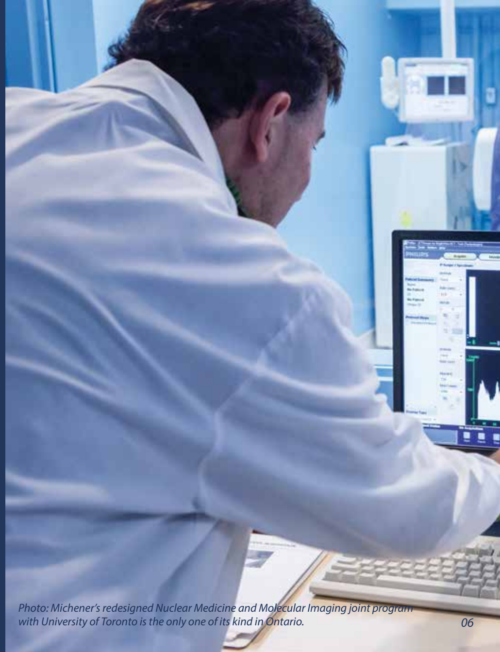
Photo: Michener's redesigned Nuclear Medicine and Molecular Imaging joint program with University of Toronto is the only one of its kind in Ontario.

The leader in applied health science education through excellence and innovation.