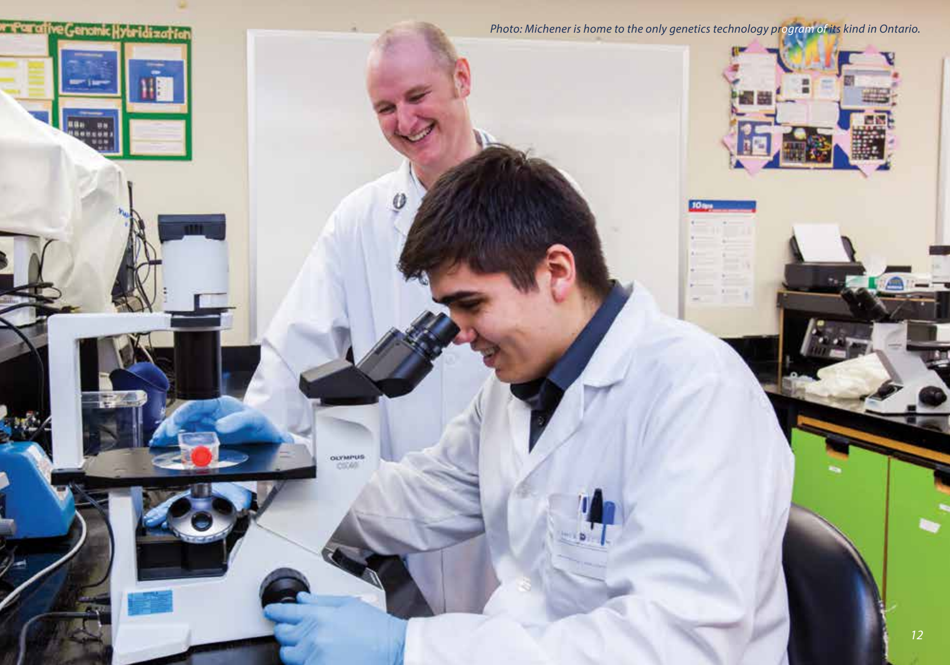
Photo: Michener is home to the only genetics technology program of its kind in Ontario.